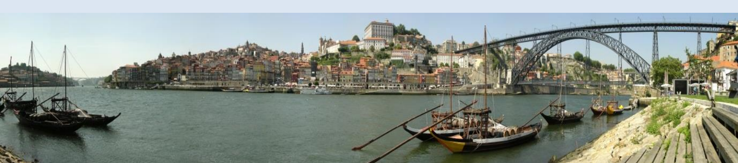
View of Porto